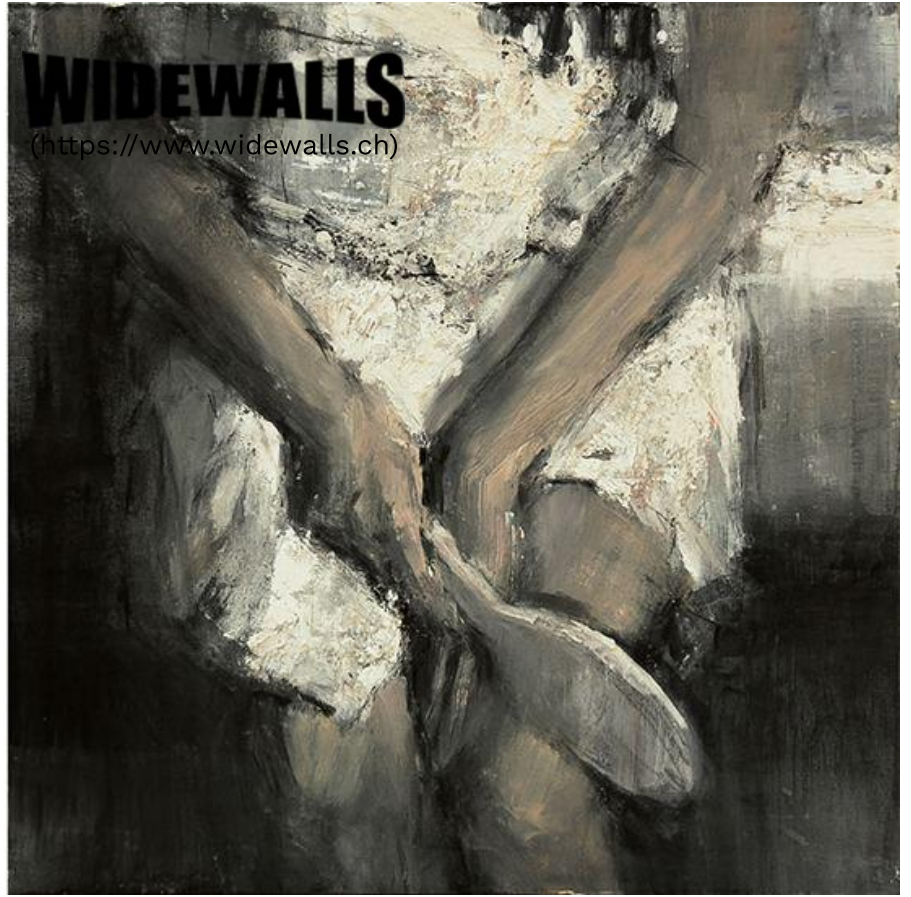
Left: Tibor Simon-Mazula – Combing / Right: Tibor Simon-Mazula – Combing 2