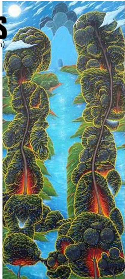
Left: Mear One – Garbage Island / Right: Siroon Norris – Untitled