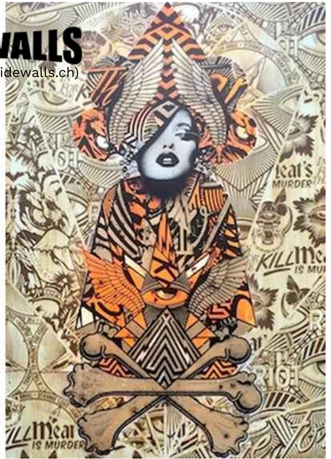
Left: Prefab77 – Death in Small Doses / Right: Prefab77 – Money Creates Taste